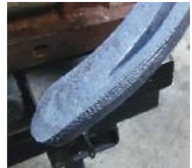
Top Finish smooth side