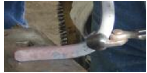
Working on face and at opposite edge of anvil, form your heels and heel check.