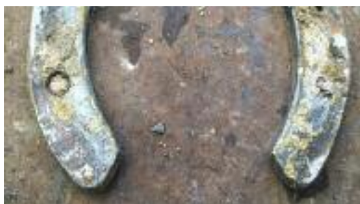
The left hind shoe indicates wear and load is more on the medial side of the shoe. Trim issue?