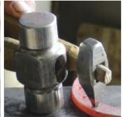
Use hammer to position forepunch to minimize heat build-up in tip. Establish your nail position and punch almost to finish depth.