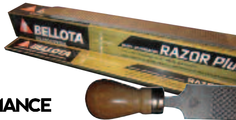
Bellota rasp handle not included.