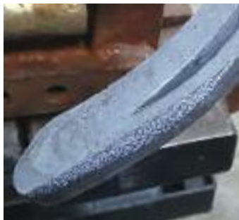
14" Half-round with Bastard Cut