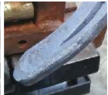
12" Triangle File with Smooth Cut