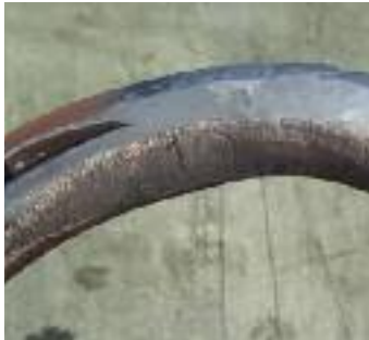
14" Pipeliner Half-Round

We worked the inner web of a classic roller to give you some sense of Half-Round file and sandbox performance.