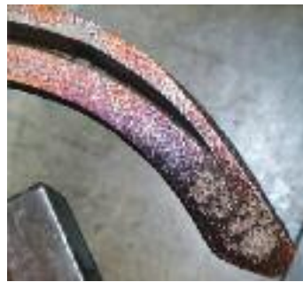
Sandbox Flat with 80 grit