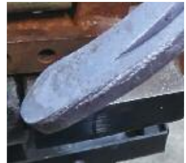
File side of Top Sharp