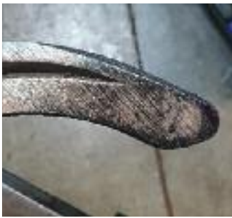
Sandbox Flat with 40 grit