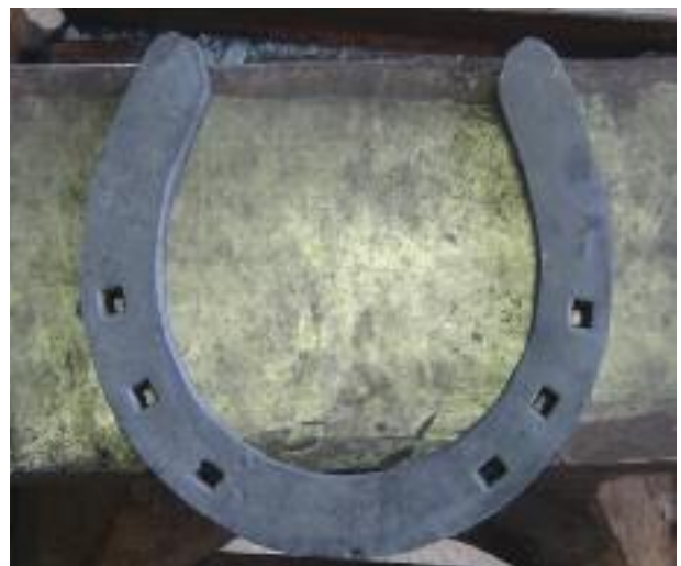
After drifting and pritcheling, make your flattening run and any last adjustments to shape.