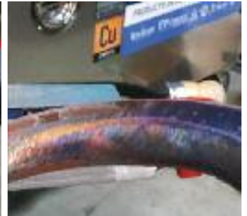
Sandbox Half-Round with 80grit

We also ran the Sandbox with an 80grit belt on a clip.