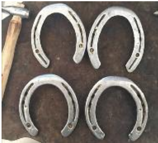
These are four shoes off the same horse. The shoes fit to the trim when applied. Question is, are there improvements that should be made? This horse is on a 4 week schedule.

We want to get your feedback and comments on these images - email us at footpro@farrierproducts.com .