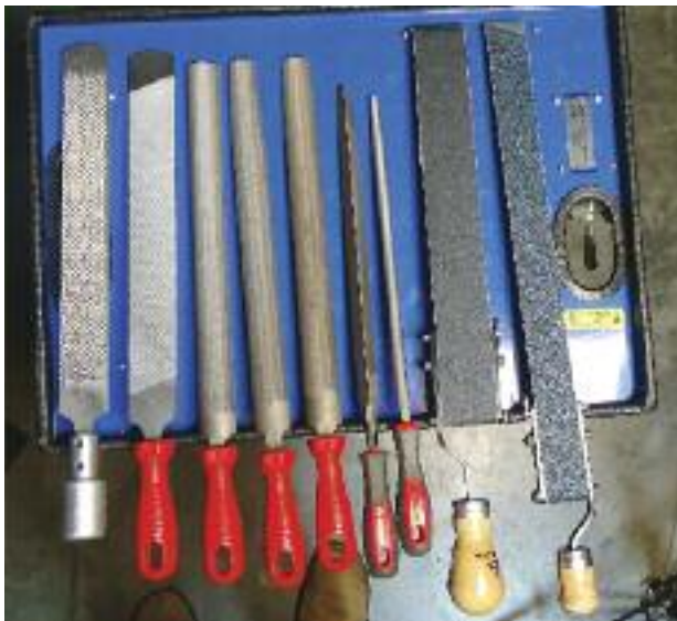
Tools that are commonly used for hand finishing, somewhat in the order of coarse to fine. (left to right) Bellota Top Sharp Rasp, Bellota Top Finish File, Bellota 14" Pipeliner Half-Round, Bellota 14" Half-Round -Bastard Cut, Bellota 14" Half-Round-Double Cut, Bellota 12" Triangle File-Smooth Cut, Bellota 12" Round File-Smooth Cut, FootPro Sandbox Regular Flat with 80grit showing, FootPro Sandbox Half-Round with 40grit showing. FootPro Sandbox Tools designed by Justin Fry.

Many farriers have power finishing equipment for shoe finishing and modifications in their daily work. The Baldor grinding units with expander wheels, attachment arms and various types of other wheels are very efficient choices for this work. However, in farrier competitions you are seldom allowed to use power equipment. You might also be at a stage in your career where power equipment available for a rig doesn't fit your budget yet, but getting a nice finish on your work is still important. FPD has developed a solid range of Bellota files and FootPro™ Sandbox tools (designed by Justin Fry) that are being used for shoe finishing as well as hoof wall finish. We've been following the competitions and see how competitors often pick up extra points for shoe and hoof wall finish. We put together some images to give you an idea what kind of "scratch" pattern each tool provides, from the coarsest to a very fine finish. You can see some of these tools in action in various Facebook clips, YouTube clips and still shots we've been posting in recent months. Each file was used for 2-3 strokes to produce the images. The shoe was at a low heat. Sandbox tools with various grits were given a number of strokes to produce an even scratch pattern.