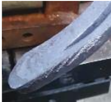
Top Finish file coarse side