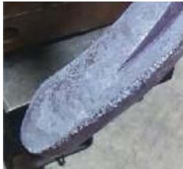
Using coarse side of Top Sharp