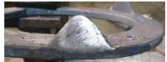
After Sandbox run with 80grit belt