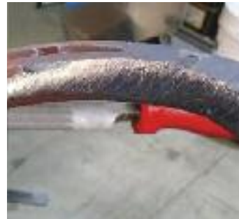
14" Half-Round with Smooth Cut