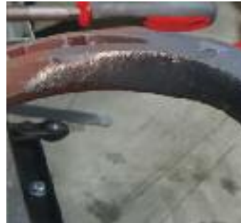
12" Round with Smooth Cut