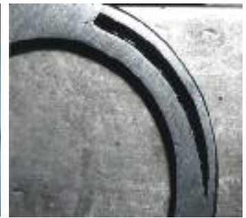
Wire brushed shoe after all steps

We worked the inner web of a classic roller to give you some sense of Half-Round file and sandbox performance.