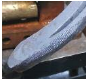
14" Half-round with Double Cut