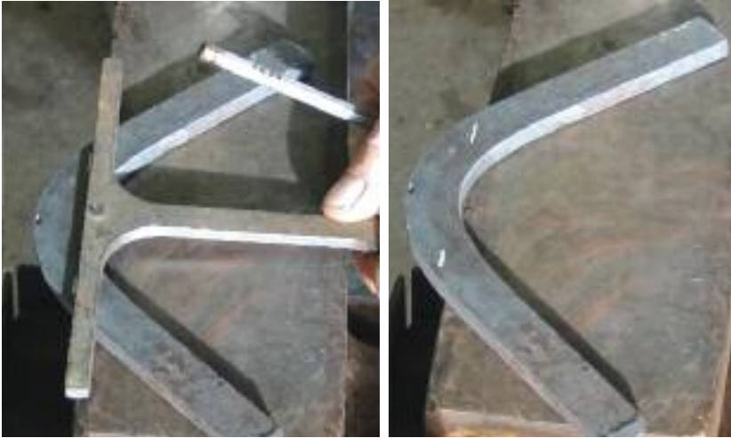
You can eyeball it or use a Bloom t-square tool to mark your toe nail.