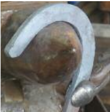
Turn branch over horn, striking the shoe just past the center of the horn to make the bend.