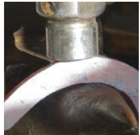
Work branch to clean up frog eyes.