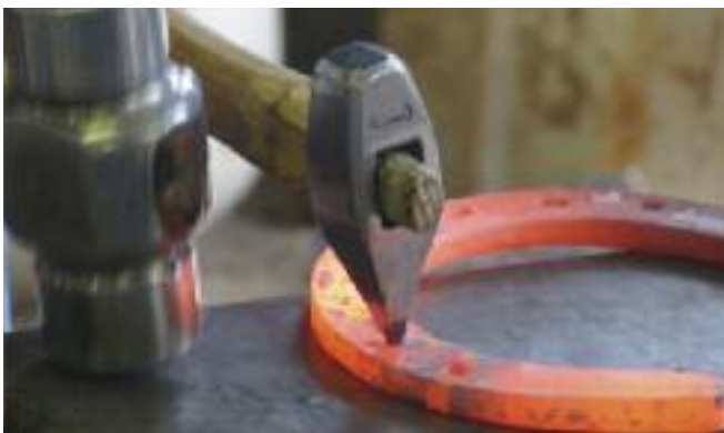
Forepunch to final depth, drift and pritchel.