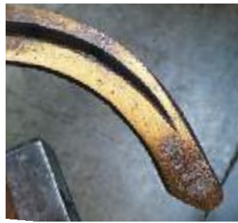
Sandbox with 120 grit