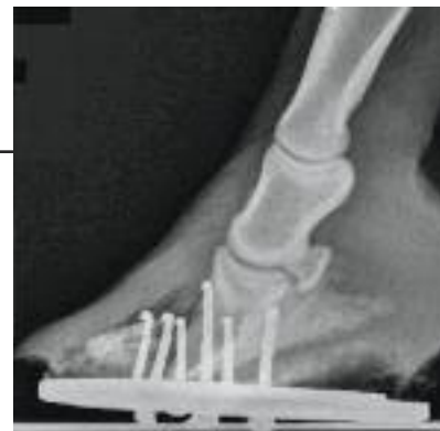
Fig. 3. - Lameness is usually only noted when extensive separation has occurred, resulting in an instability of the distal phalanx within the hoof capsule