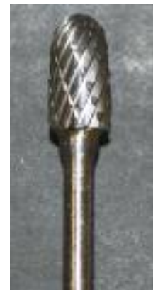
Fig. 7 - Carbide cross cut burrs.