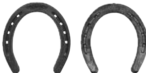
NEW DIAMOND CLASSIC PLAIN