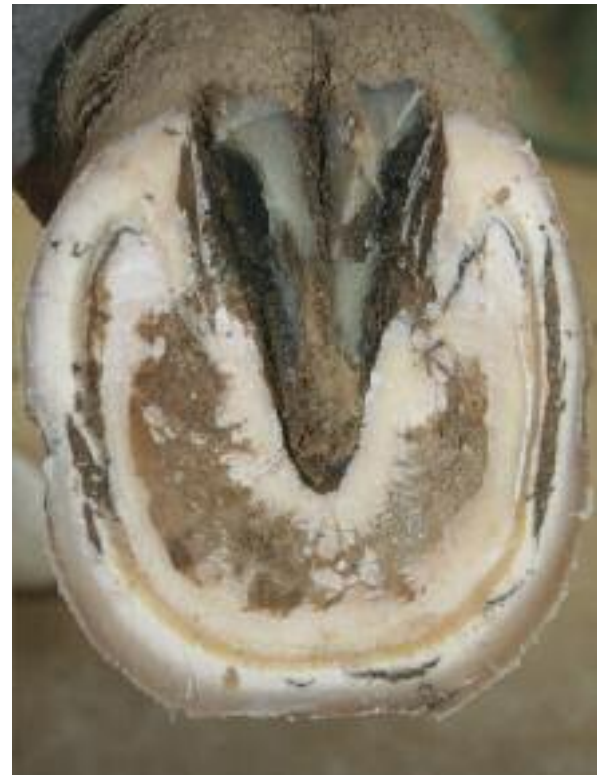
Fig. 1 - Cases of WLD are often first noticed by farriers during routine trimming/shoeing visits. An area of separation in the hoof wall that is filled with dirt/debris is noted.

The cause of WLD has long been debated. Although several theories have been described, none have been proven. The current theory of WLD etiology as described by O’Grady, Moyer and others is that opportunistic, keratinopathogenic microorganisms invade the non-pigmented stratum medium of the hoof wall following an initial separation caused by a mechanical stress or weakness, trauma, abnormal or excessive moisture exposure, or some combination. 1,2 These organisms degrade the keratin in the hoof wall exacerbating the separation. Furthermore, dirt and debris typically fill the separation, acting as a mechanical wedge forcing the wall apart.