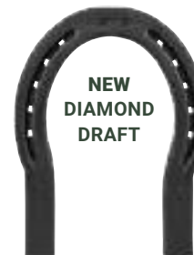
NEW DIAMOND DRAFT