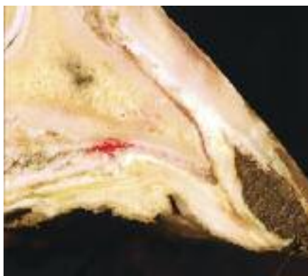
Fig 2. - There can be rather large areas of separation filled with dirt/debris despite maintaining a healthy appearance of the outer hoof wall.

wall that is filled with dirt/debris is noted (Fig. 1). When removing the dirt/debris with a hoof knife or curette, an area of undermined hoof of varying degree is revealed. After the dirt/debris is removed, portions of white/grey powder like hoof wall are typically seen before reaching a healthy margin. There can be rather large areas of separation filled with dirt/debris despite maintaining a healthy appearance of the outer hoof wall (Fig. 2). Lameness is usually only noted when extensive separation has occurred, resulting in an instability of the distal phalanx within the hoof capsule (Fig 3).