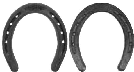
NEW DIAMOND BRONCO PLAIN